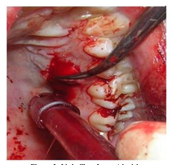
Figure 3: Liu's Class I type A incision

After preparation of the recipient bed, the donor area in the palate was anesthetized by block anaesthesia for the greater palatine nerve with 2% Lignocaine with 1:80,000 adrenaline. The selected site was posterior to rugae and not extending beyond the maxillary first molar. The greater palatine artery was assumed to be located at the junction of the vertical and horizontal walls of the palatal vault. Safety margins of 3mm from the greater palatine artery and 2 mm from the gingival margin were calculated. The previously obtained measurement was used as a guideline and the same was outlined on the donor site by an indelible pencil before harvesting of the graft. The graft harvesting was planned to exclude adipose tissue and glandular tissue, since these tissues may prevent proper revascularization of the graft on the recipient bed.