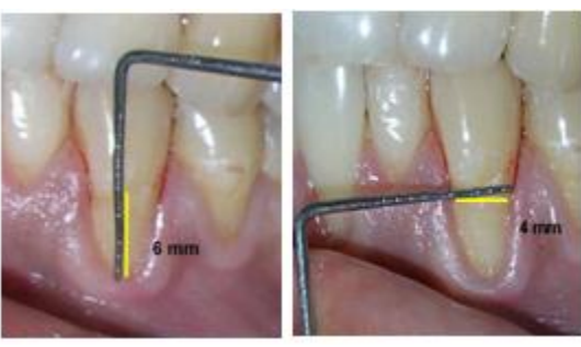
Figure 1: Measurement of Recession Depth and Width

After part preparation the area was anaesthetised using 2% Lignocaine with 1:80,000 adrenaline. Care was taken that the local anaesthetic infiltration did not give rise to "ballooning" effect in the recipient area. Measurement of recession depth and width were carried out [Figs 1].