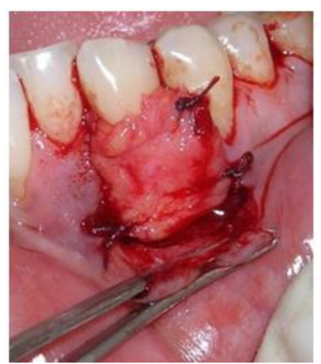
Figure 5: Placement of stabilization sutures

The connective tissue graft was sutured to the underlying connective tissue at the level of CEJ using 5-0 Vicryl suture. Stabilizing sutures were given at the apical portion of the graft [Fig 5]. Following graft stabilization, gentle pressure with moist gauze was applied to prevent dead space formation. The partial thickness flap was sutured with interdental and lateral sutures using 5-0 polypropylene suture [Fig 6]. An aluminium foil was placed over the recipient site and a periodontal dressing was given.