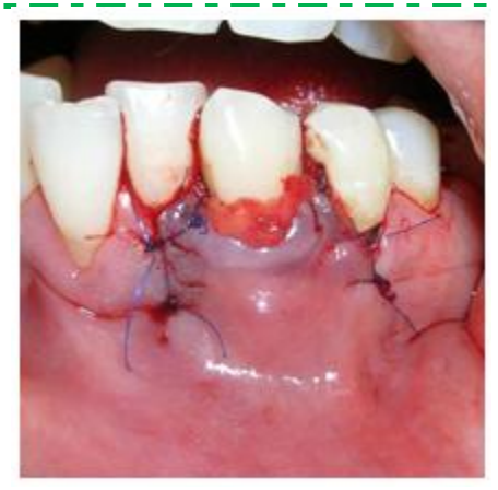
Figure 6: Graft coronally positioned and sutured

Volume 5 (Issue 2): February 2018 ISSN: 2394-9414 DOI- 10.5281/zenodo.1172556 Impact Factor- 4.174